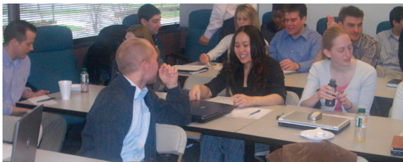
At a Biodontics seminar in Michigan